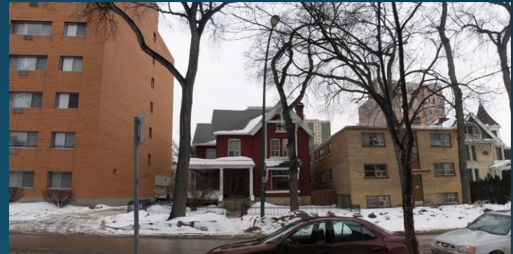
Housing in Winnipeg, MB