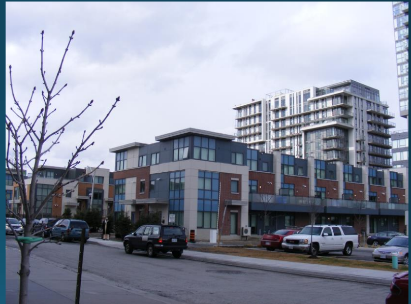
Sean_Marshall 2011, April 17 - Condo and public housing together