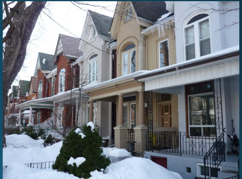
Housing in Toronto, ON