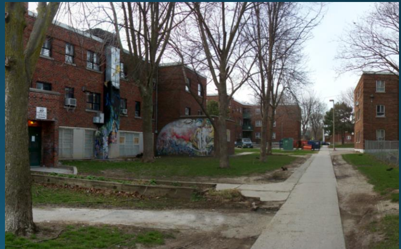
samuel bietenholz 2013, April 26 - DSCo4487-489